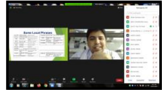
Screenshots of presentation by the resource persons